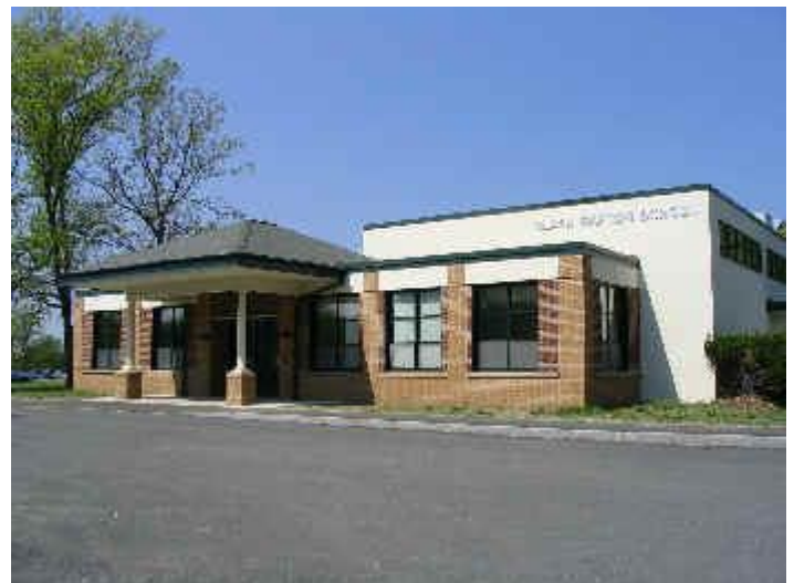
Clara Barton School