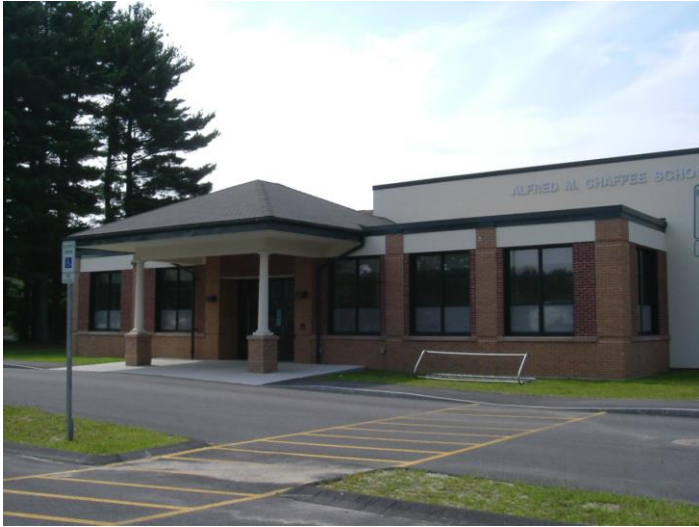
A.M. Chaffee School