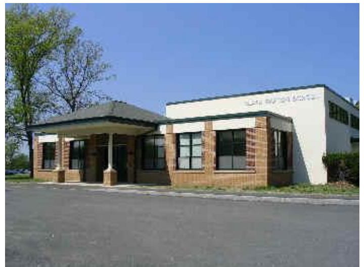
Clara Barton School